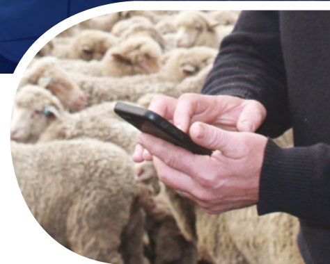
National Vendor Declarations are now available electronically (the eNVD).

The National Livestock Identification System (NLIS) is Australia's system for the identification and traceability of cattle, sheep and goats. The NLIS combines three elements to enable the lifetime traceability of animals: a visual or electronic ear tag, a Property Identification Code (PIC) for identification of physical location, and online database to store and correlate the data. Visit www.nlis.com.au