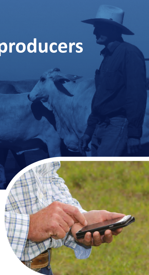
National Vendor Declarations are now available electronically (the eNVD)

The National Livestock Identification System (NLIS) is Australia's system for the identification and traceability of cattle, sheep and goats. The NLIS combines three elements to enable the lifetime traceability of animals: a visual or electronic ear tag, a Property Identification Code (PIC) for identification of physical location, and an online database to store and correlate the data. Visit www.integritysystems.com.au/nlis