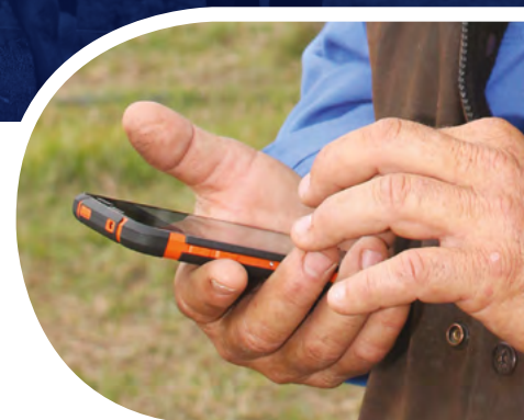
National Vendor Declarations are now available electronically (the eNVD)

The National Livestock Identification System (NLIS) is Australia's system for the identification and traceability of cattle, sheep and goats. The NLIS combines three elements to enable the lifetime traceability of animals: a visual or electronic ear tag, a Property Identification Code (PIC) for identification of physical location, and an online database to store and correlate the data. Visit www.integritysystems.com.au/nlis